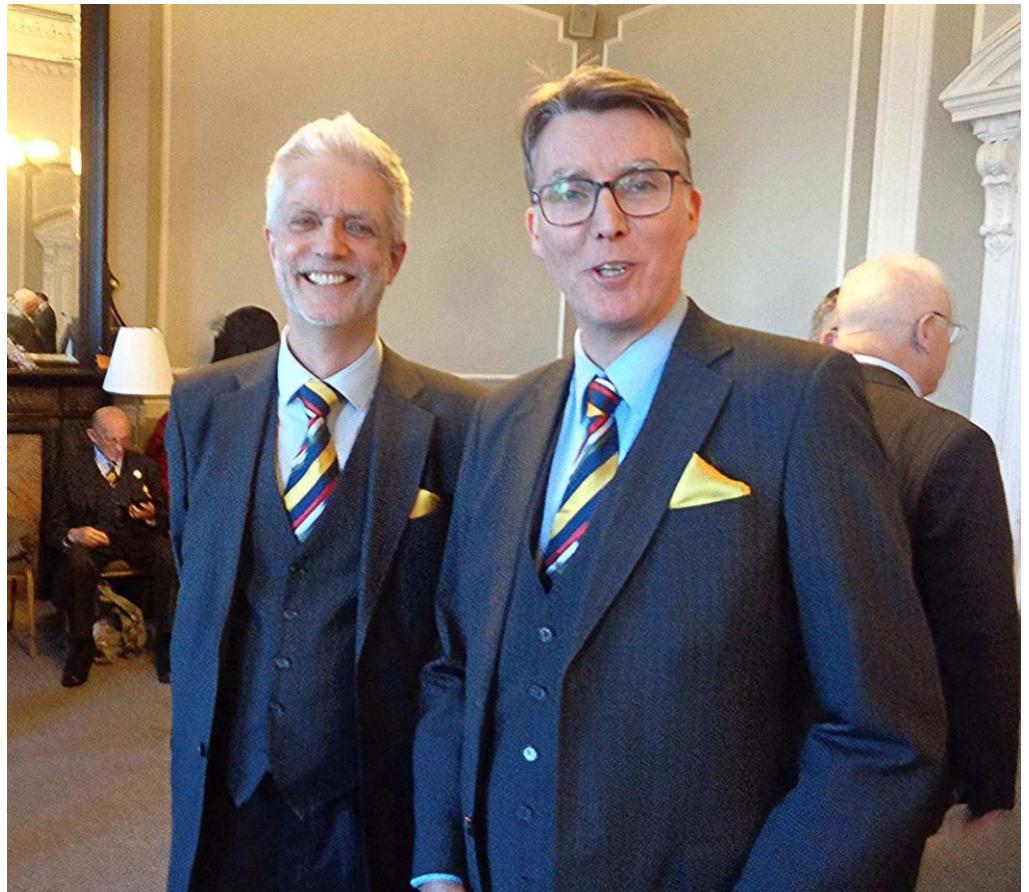
Furtive shot from a percussion player's phone