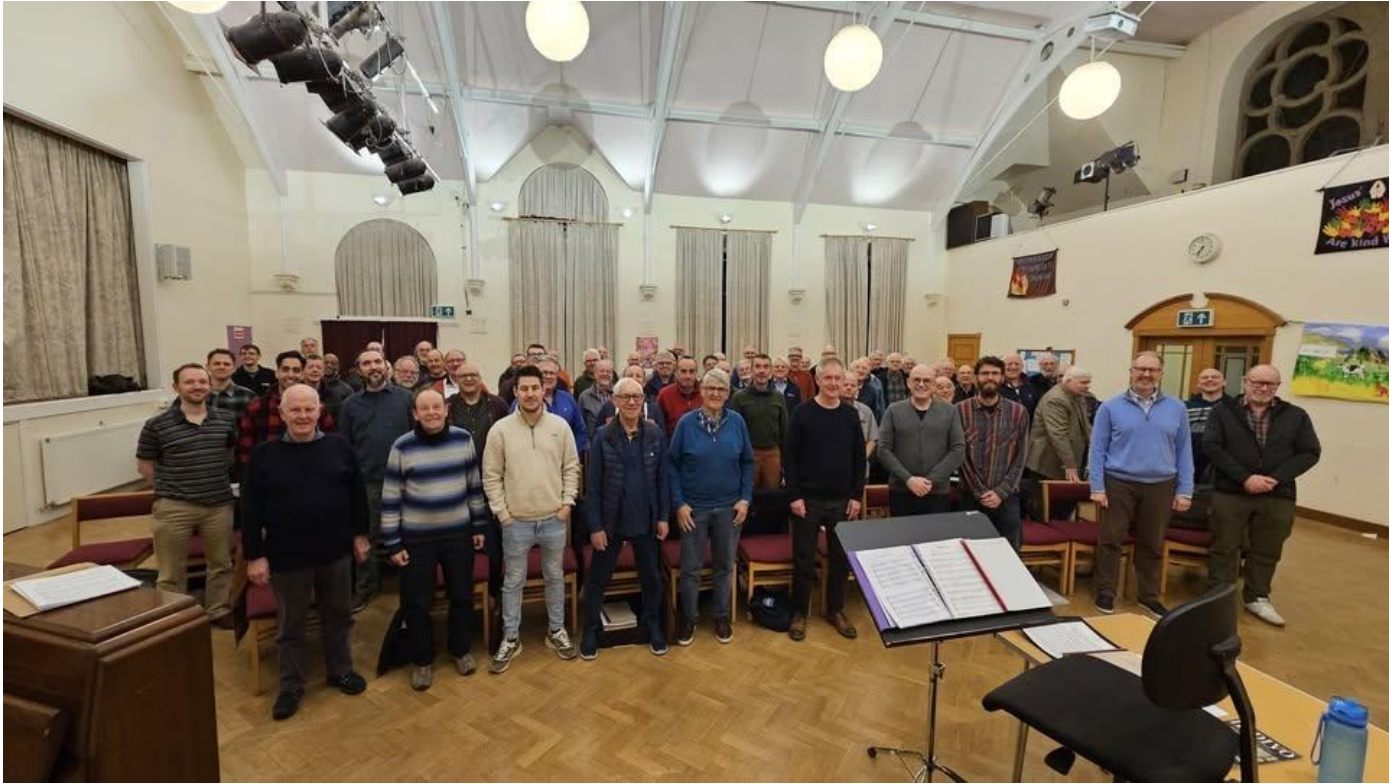
Our new rehearsal room

Over recent months the Choir has trialled various alternative venues and - after some debate - we've moved on to the next village down in the Colne Valley, Linthwaite . Here, the Methodist Church has offered us (nearly) all that we could require - mainly a rehearsal space with a wonderful acoustic, but, maybe equally important, spaces with effective heating and updated sanitation and décor. They've made us feel very welcome and the membership, by and large, is very content with the change.