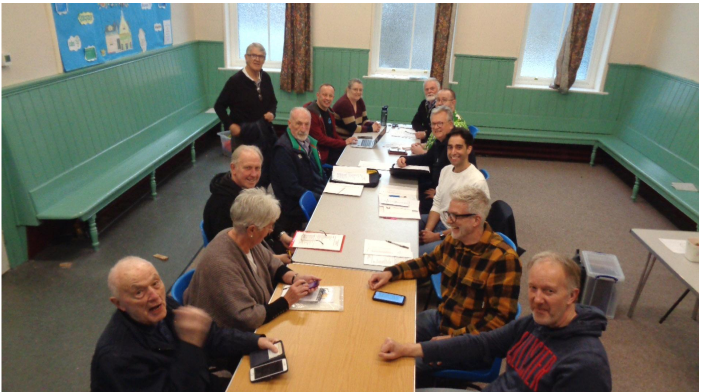
First Management Committee meeting in our new venue

There's no doubting that for many it really is the end of an era!