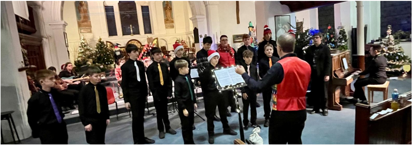
The smaller boys, too, were terrific.