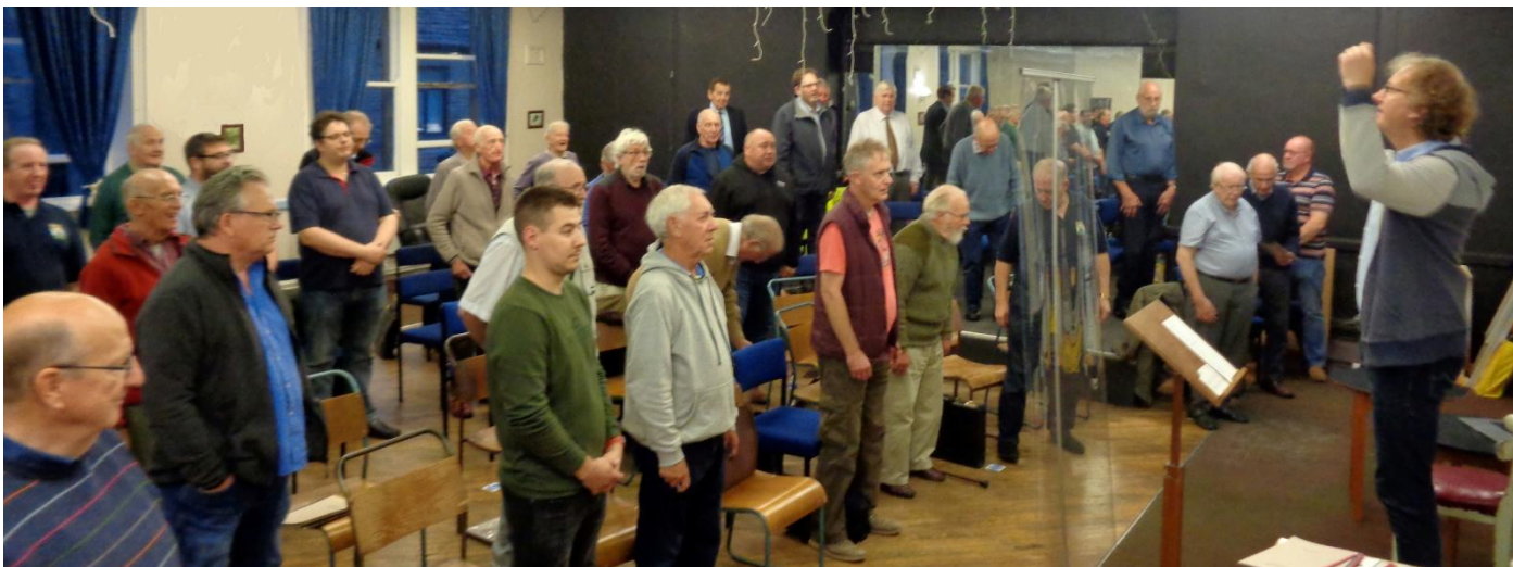
Rehearsals of Christmas music are in full swing.

And so we are - getting ready for the big Christmas Concert with the two choirs and our old friends, the wonderful Brighouse & Rastrick Band on Sunday evening December 12 th .