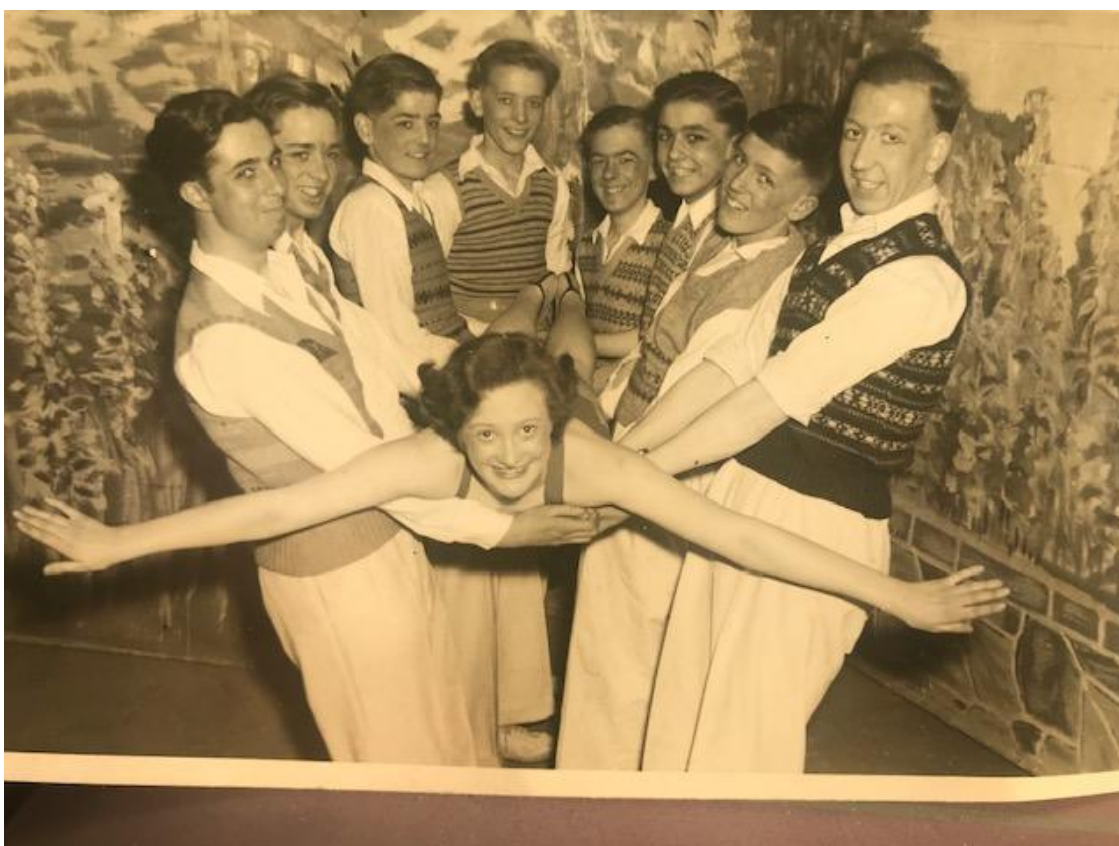
From the Marsden Methodist Operatic Society's 1952 production of 'No, No Nanette.'