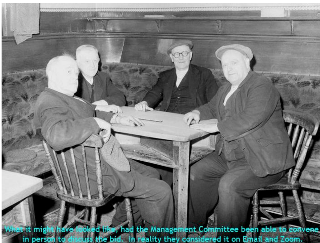
What it might have looked like, had the Management Committee been able to convene in person to discuss the bid. In reality they considered it on Email and Zoom.