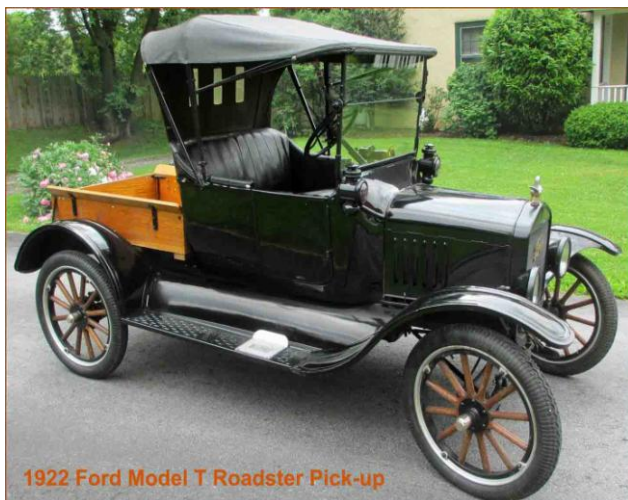
1922 Ford Model T Roadster Pick-up

We have enjoyed many other successful events over the year – both formal (such as the ever-popular Christmas Concert at the Town Hall) and informal (for example performing as part of our community for the Colne Valley Lions). Each event is hugely important to ensure that our reputation is upheld and our enjoyment of music making is shared across our community. I hope that every choir member feels that your contribution is valued and your presence is important – because it certainly is.