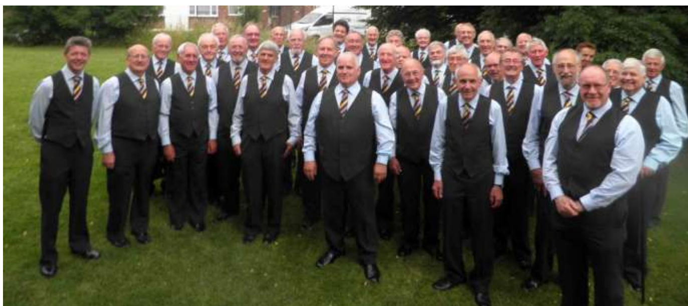
Some of the Choir on a hot evening in Widnes