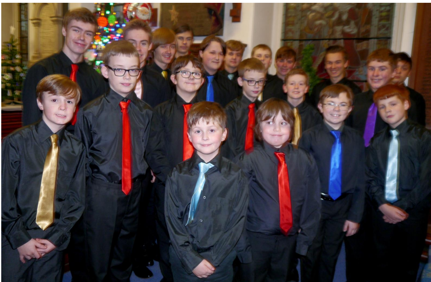
Most of the Boys as seen at Slaithwaite, St James' on Saturday 3 rd .