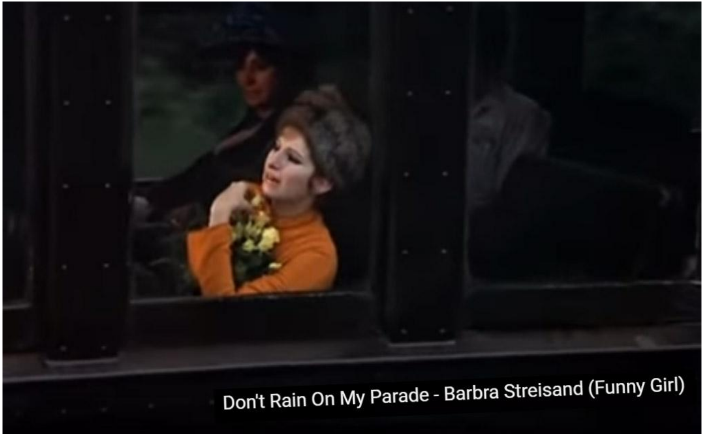
Don't Rain On My Parade - Barbra Streisand (Funny Girl)