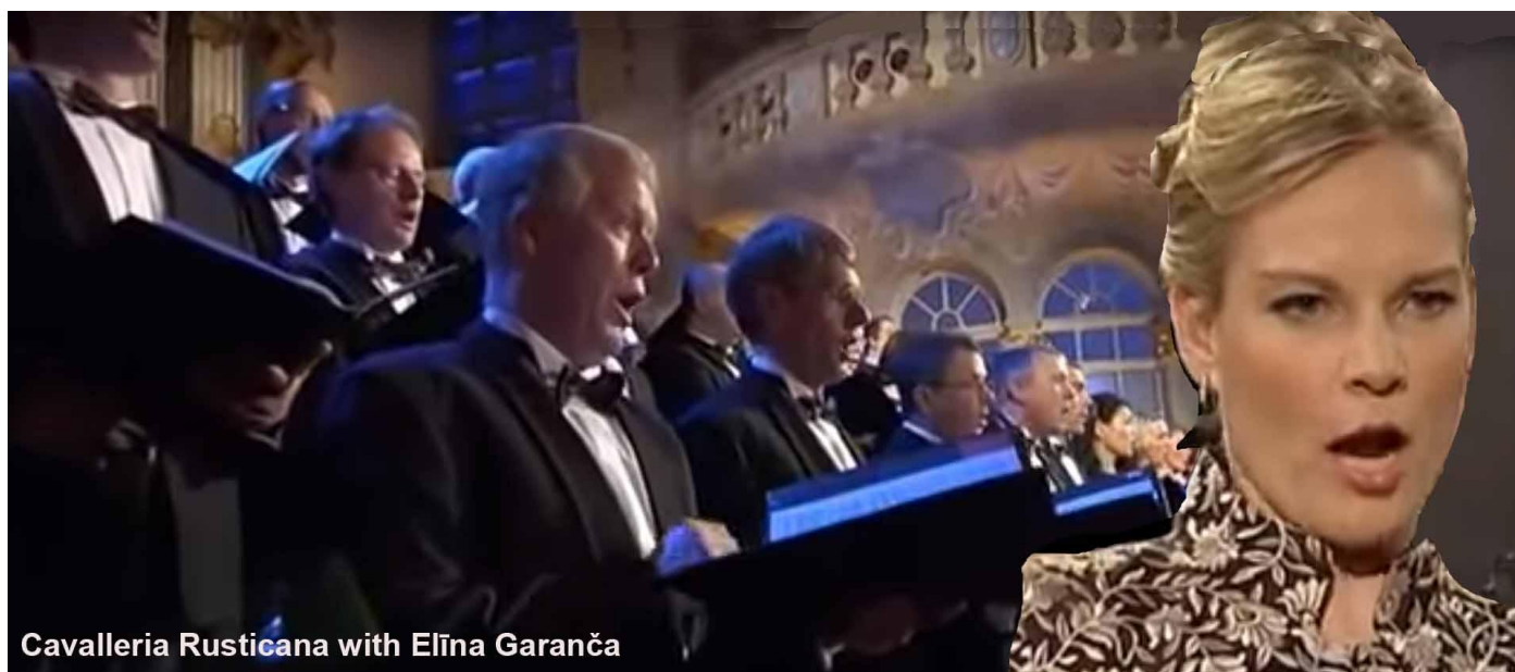
Cavalleria Rusticana with Elīna Garanča