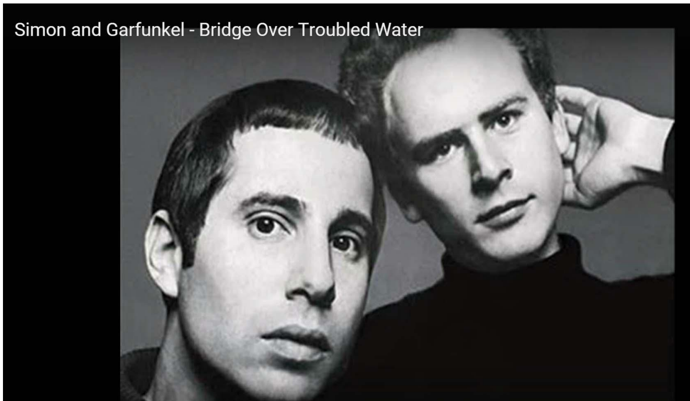
Simon and Garfunkel - Bridge Over Troubled Water

Bridge over Troubled Water was the title song to the fifth and final studio album by American folk rock duo Simon & Garfunkel. Described as both their 'most effortless record and their most ambitious', it was released on January 26, 1970 and several re-releases followed.