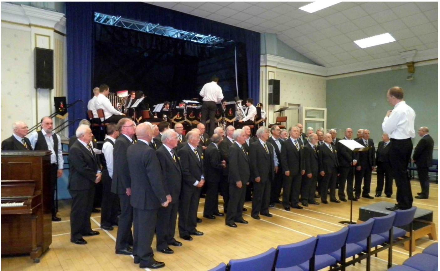
Choir and Band sort out performance details in pre-concert rehearsal.

The Choir and Hade Edge Brass band got together in mid June to put on a terrific concert at Holmfirth's Civic Hall – a new venue for the Choir in recent years - and quite a success it was, too.