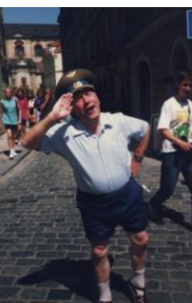
1994 to Germany again