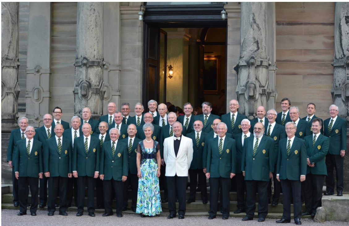
The Daleian Singers at Sandon Hall 2014

As for us, we've had our inquest, explored the critique of our performances and we live to fight another day.