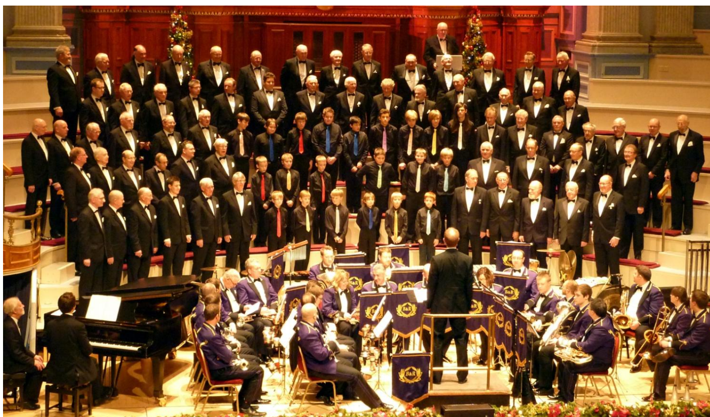
Colne Valley Male Voice Choir and Colne Valley Boys with Brighouse and Rastrick Brass Band at Huddersfield Town Hall, December 14, 2014.