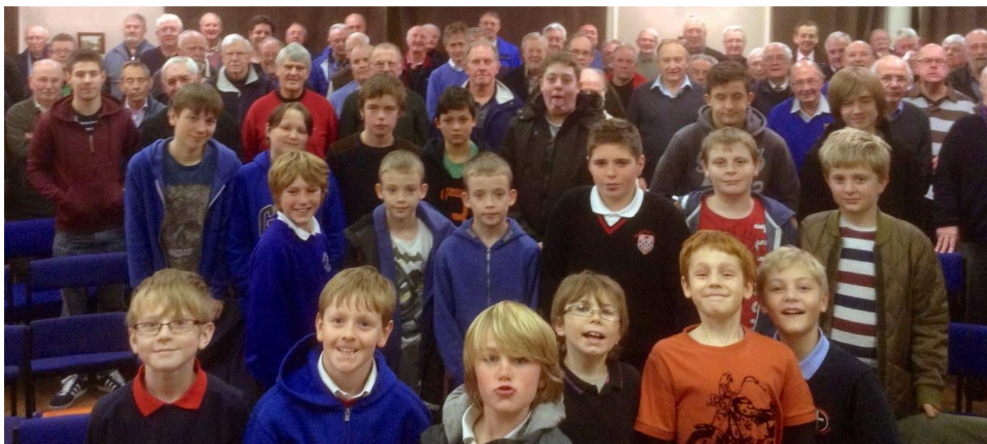
Colne Valley Male Voice Choir and Colne Valley boys in rehearsal for last Sunday's Town Hall Concert

The audience's thoroughly good night was brought to a conclusion by the haunting, 'Irish Blessing', "...and until we meet again, may the God that loves us all, hold you in the palm of his hand".